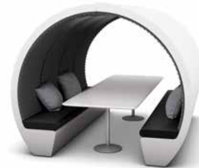
■ 8 person open