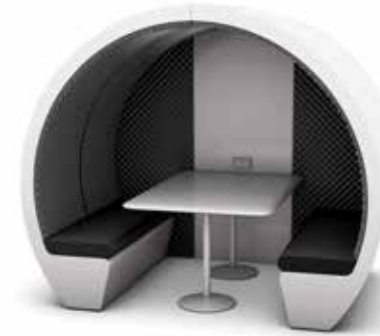
■ 4 person, acoustic back panel