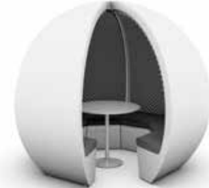
■ escape pod