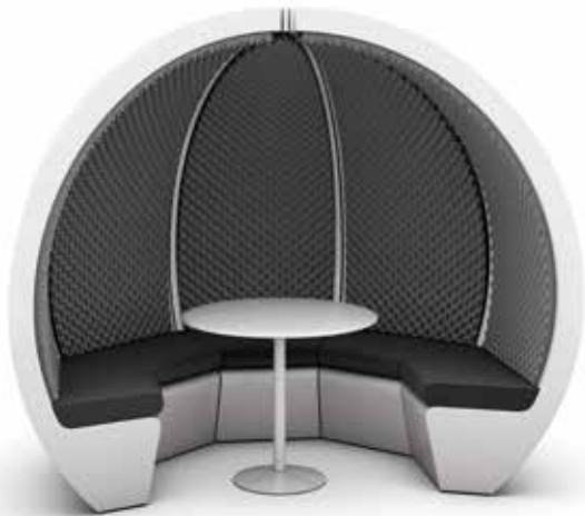
■ 5 person escape

Sometimes we just need to get away from our desks, the escape pod provides the perfect tranquil environment to make that private call or recharge, ready for the next challenge.