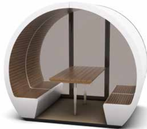
■ Outdoor pod, standard interior, rear glass enclosure