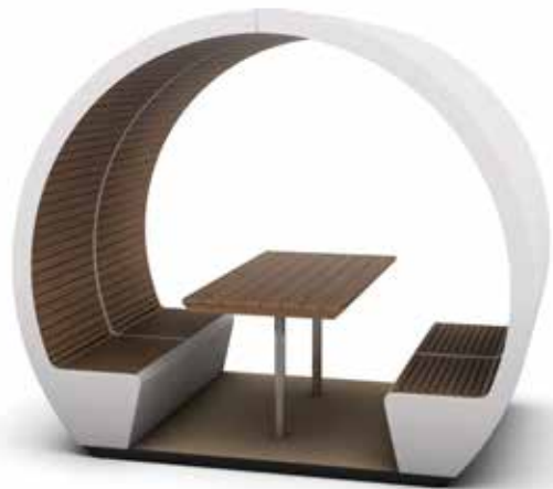
■ Outdoor pod, standard interior

Let's meet, work or take lunch outside! Our outdoor pods with device charging facilities via solar panel option, offer the perfect environment to get the job done whilst getting away from the office.