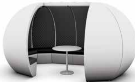
■ modular pod