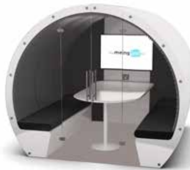
■ 6 person, acoustic back panel, full glass enclosure