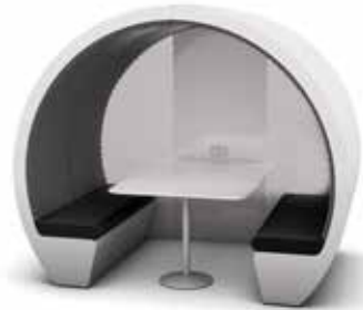
■ meeting pod