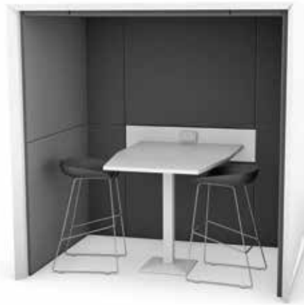
■ Coffee bar layout, fabric interior