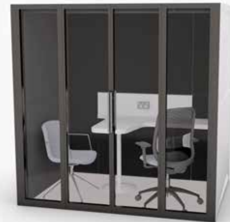
■ Private office layout, solid back panel, full glass enclosure