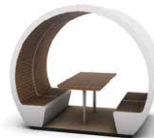
■ outdoor pod