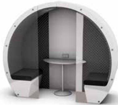
■ 2 person, acoustic back panel, part glass enclosure