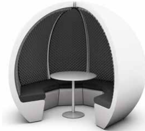
■ 6 person escape