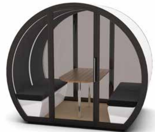
■ Outdoor pod, office interior, rear and front glass enclosures