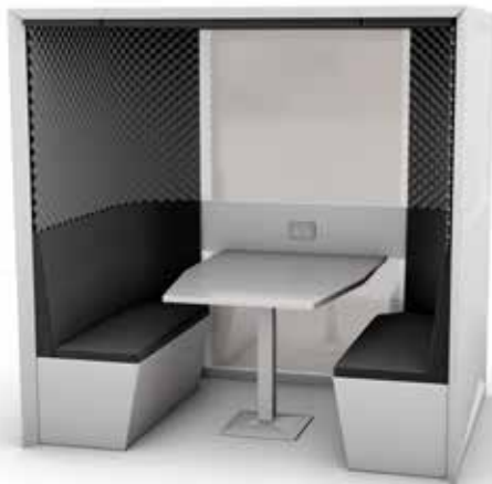
■ Standard pod 2 layout, glass back panel

With its clean linear design either as individual units or as a bank of connected pods and its multiple layout options, pod 2 is the versatile choice delivering a host of potential uses.