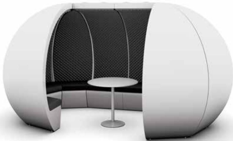
■ 10 person modular

By using segments from our meeting and escape pods, our modular pods can create almost any shape to fit the size, space and purpose required.