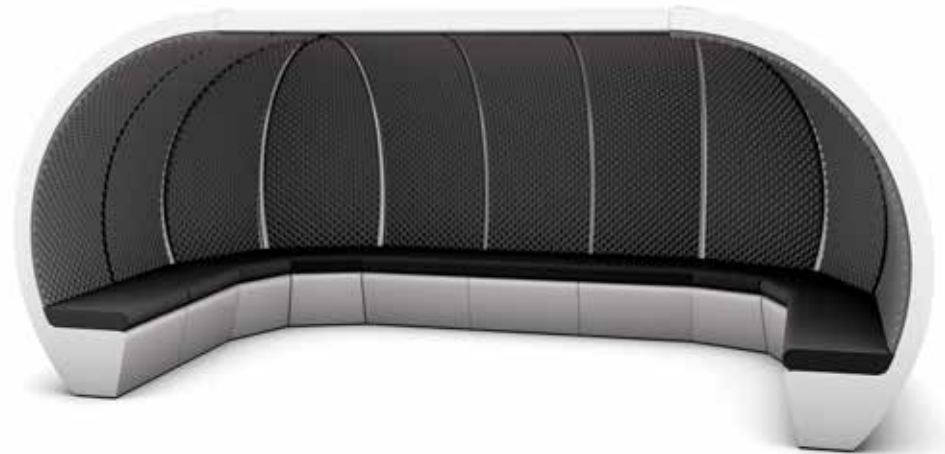
■ 11 person modular