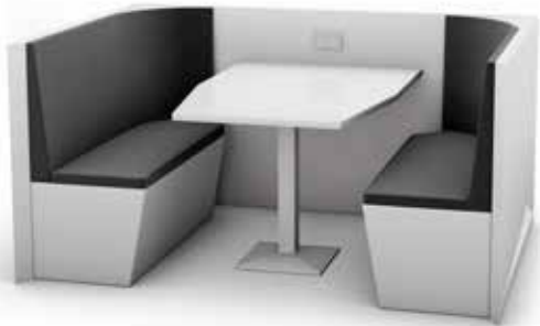
■ Standard booth layout

Being half the height of pod 2 , our booths have the adaptability to slot into the smallest of spaces or occupy an entire wall .