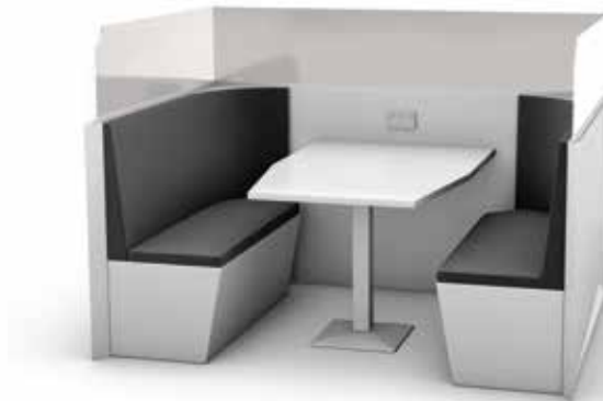
■ Standard booth layout, privacy glass surround