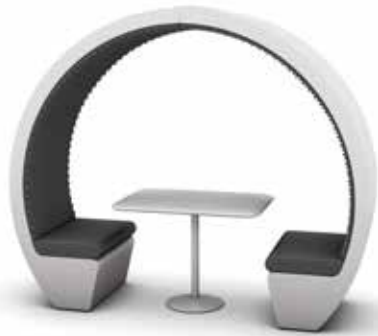
■ 2 person open

With its stunning design, modular capability and full range of accessories, the meeting pod can deliver a collaborative working environment in any space.