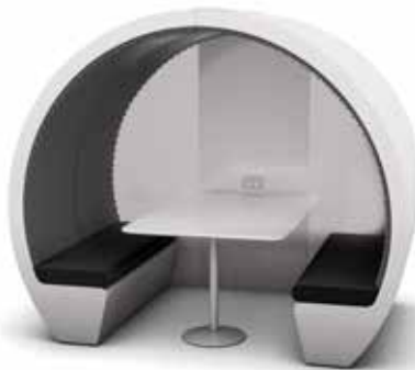
■ 4 person, glass back panel