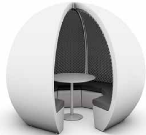
■ 7 person escape